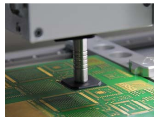
Automatic component placement