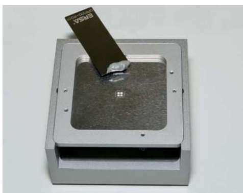
Dip & Print Station with "MLF32" stencil