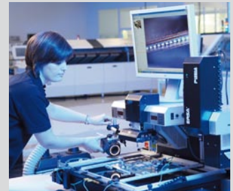
Hundreds of IR/PL 650 systems have proven themselves as easy to operate