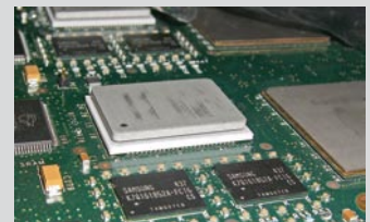
Heavy mass components on heavy mass, big boards can be reworked