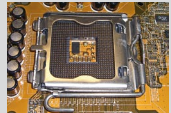
Metal shields, sockets and components are easily handled